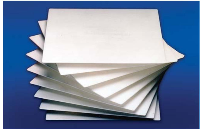
Seitz K Series Filter Sheets